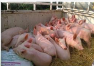
Large white(yorkshire) breed of piglets brought for distribution to farmers