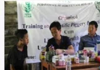
Distribution of livestock vitamins and minerals to the farmers