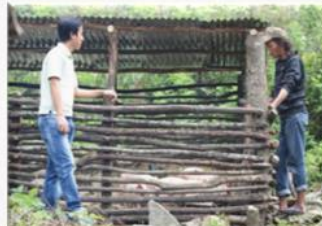
Monitoring of newly distributed piglets in field farmers