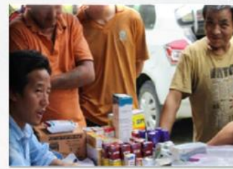
Distribution of vaccines, vitamins and minerals to the farmers