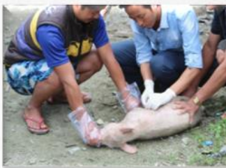
Treatment given for ecto-parasite infestation of pigs