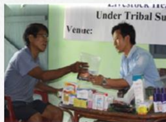
Distribution of livestock vitamins and minerals to the farmers